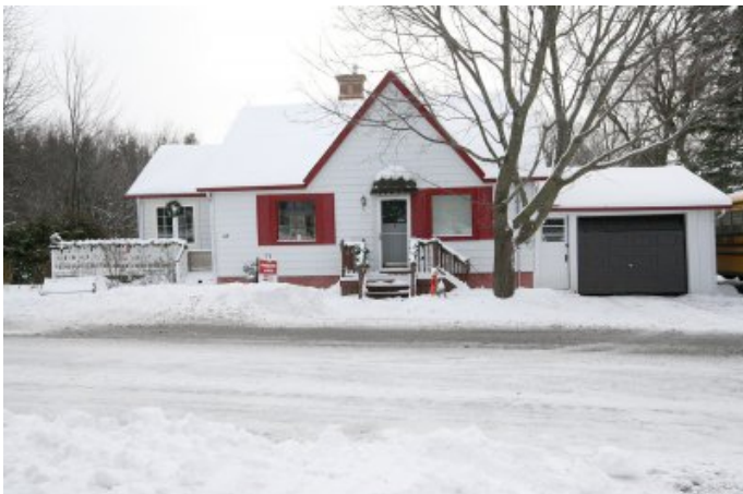
3 Bedroom 2 Storey in Russell